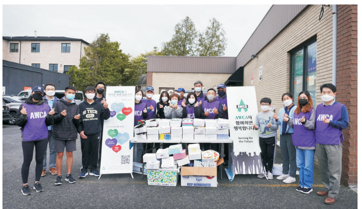
Helping Single - Parent Homes - with KAAPP and CDPC's Youth Group