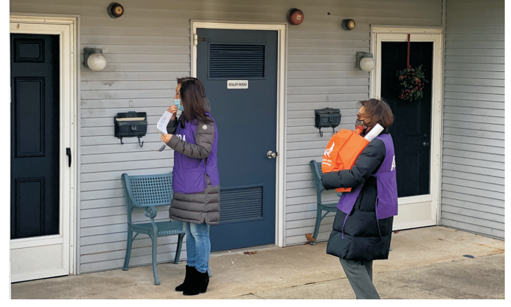
Love Food Baskets - AWCA Board Members Delivering Angel Baskets