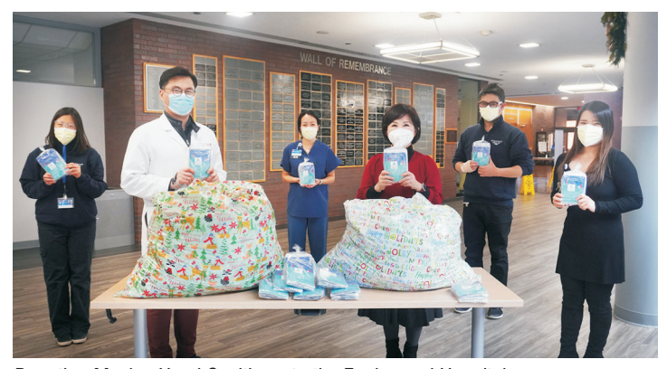
Donating Masks, Hand Sanitizers to the Englewood Hospital