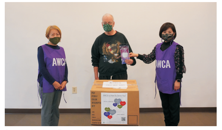
Donating Masks to Teaneck Veterans Association