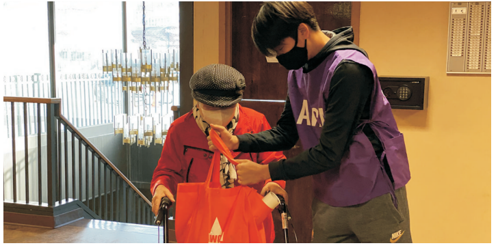
Love Food Baskets - Delivering Angel Baskets