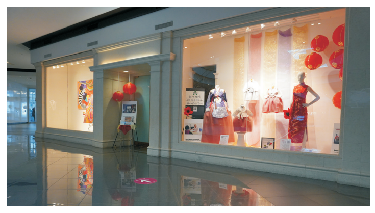
Lunar New Year Exhibition in the Riverside Mall