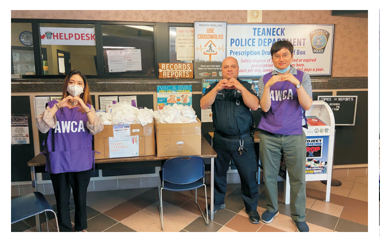
Father's Day - Delivering Lunches to Teaneck Police Dept.