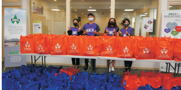
Packaging Angel Baskets - Youth Volunteers