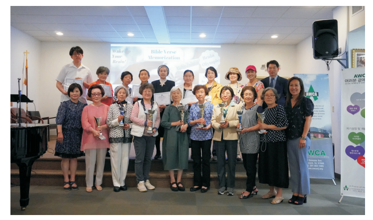
Dementia Prevention - Brain Olympic (Bible Memorization Contest) Winners