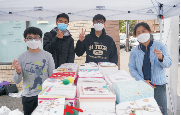
Angel Baskets - CDPC's Youth Group