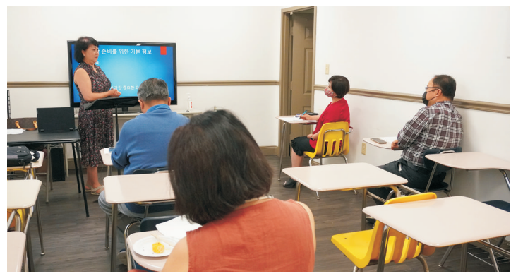
Seminar for Preparation of College Admission